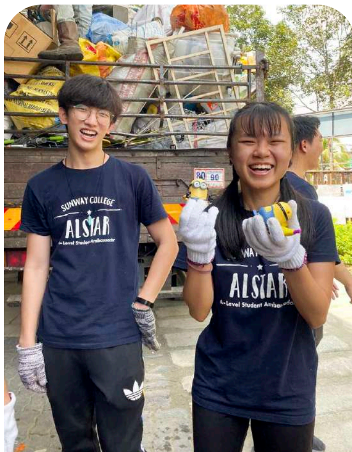
Community service - Recycling

There are many extracurricular activities available to all students in the institution. These activities are usually held during the weekdays, but may occasionally be scheduled over weekends and public holidays. Students are encouraged to participate in extracurricular activity as it provides a more wholesome development. It may also enhance a reference or testimonial.