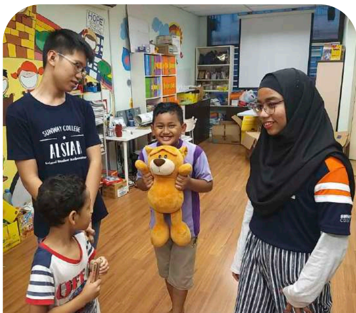
Community service - Orphanage visit

If a student is found to be too far behind in the syllabus and unable to catch up due to lack of attitude/apptitude then he/she will be counselled to drop a subject. If two or more lecturers agree he/she lacks the ability to cope, after the mid-semester report, he/she will be counselled and further action will be recommended accordingly.