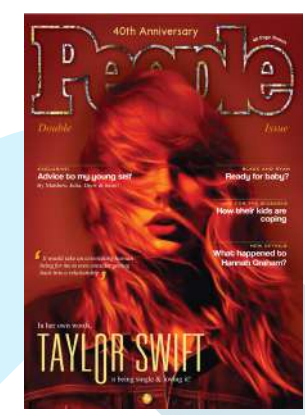
Magazine cover re-design by Leong Ee Jae (COM2143 Publication and Production Design)