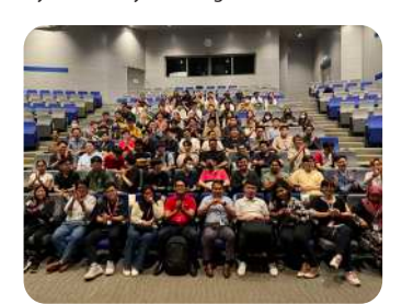
Cybersecurity community meetup with SherpaSec